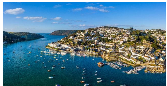
Salcombe, Devon

The town has swapped places with last year's priciest spot – Sandbanks in Dorset - with an average price tag of £1,244,025.